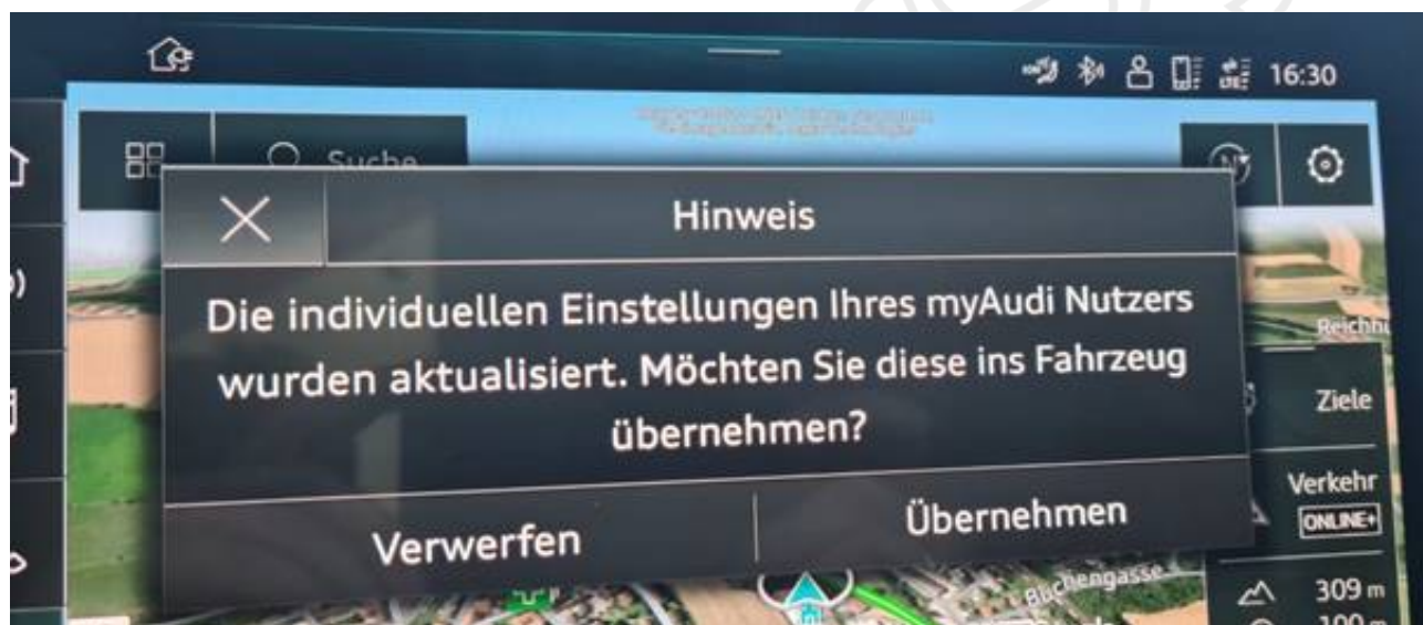
Image: The individual settings for your myAudi user have been updated. Would you like to apply these in the vehicle?

A notification about the individual settings of the myAudi user keeps appearing on the MMI.